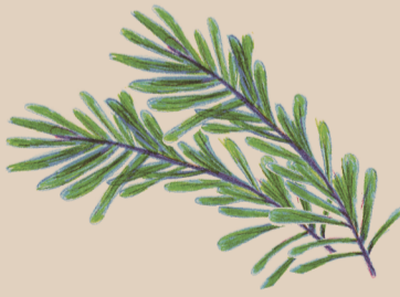
ROSEMARY Salvia rosmarinus