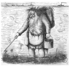
Cartoon of Stinky Father Thames