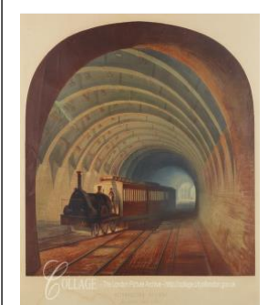
First underground railway